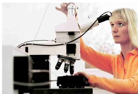
Fig. 1: Confocal Raman Microscope WITec CRM 200

Equipment Demonstration & Hands-On Session continuing